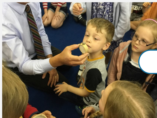
Phoenix & Sprites exploring moths