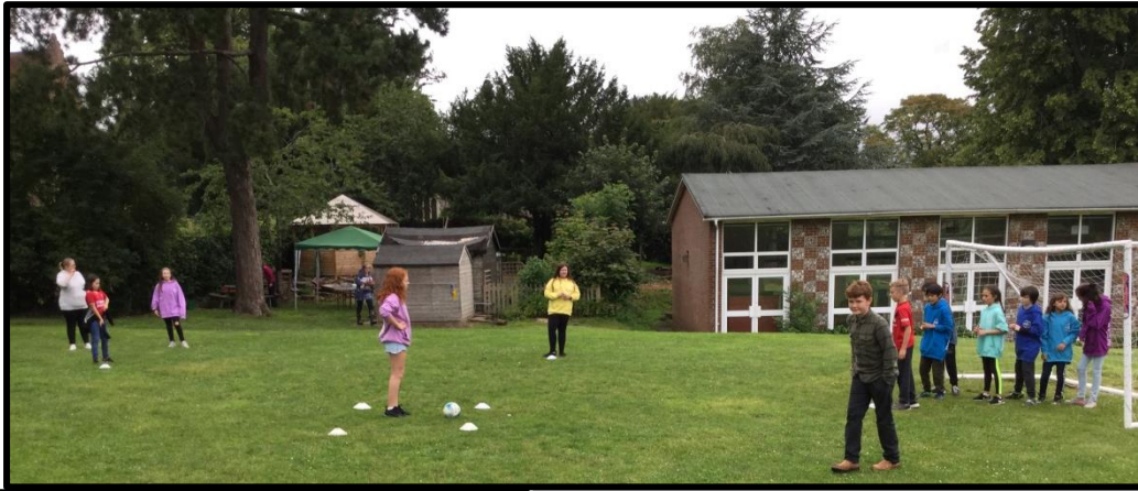
Year 6 enjoying their leaver's barbecue on Thursday in spite of the weather!