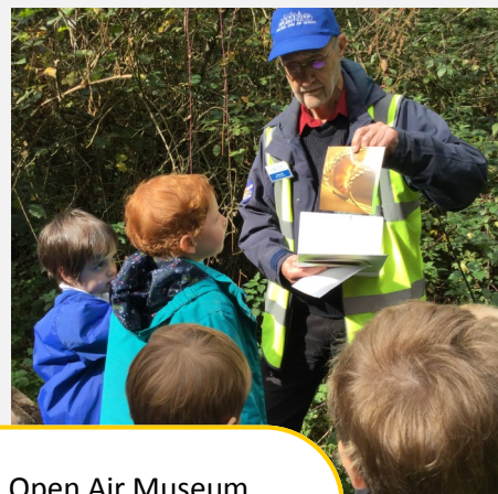
Sprites had a great day at Chiltern Open Air Museum learning about The Little Red Hen story